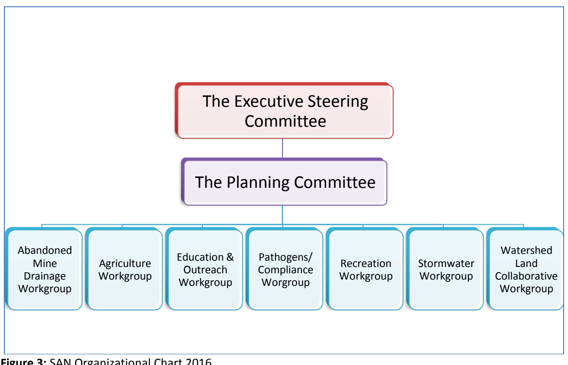
Figure 3: SAN Organizational Chart 2016