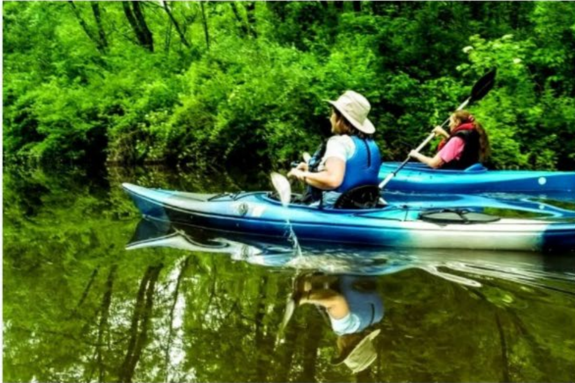
Wednesday Evening Paddles

These community events are offered during our primary operating season. (May-September)