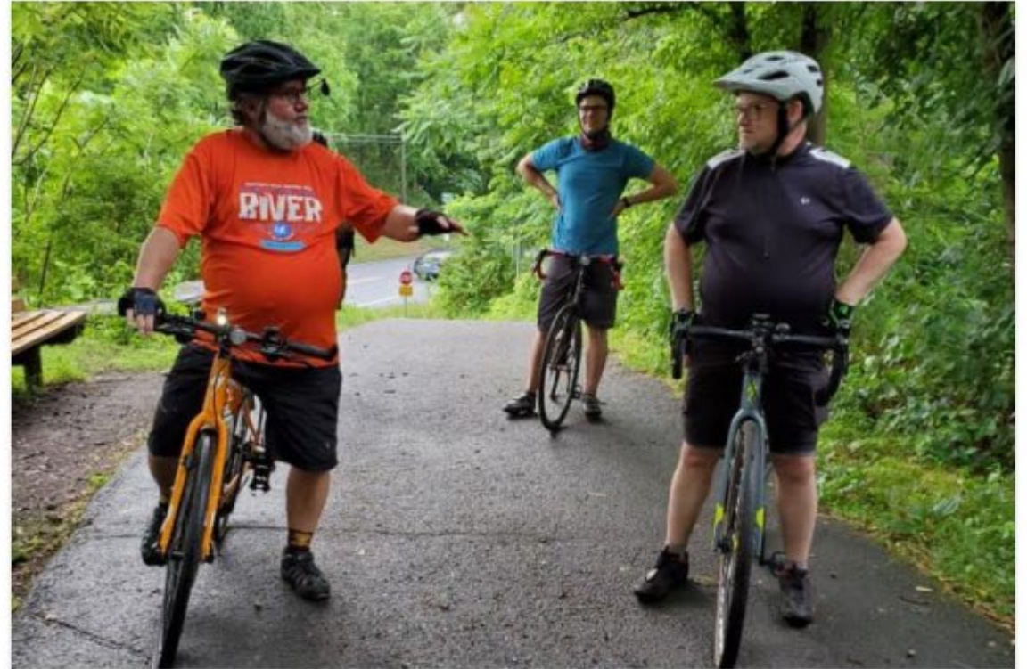
Friday Night Bike Rides