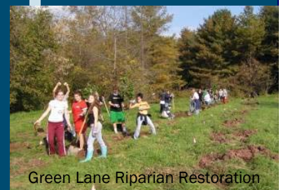
Green Lane Riparian Restoration