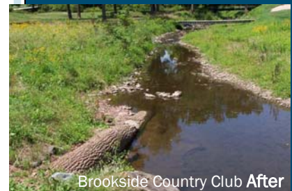
Brookside Country Club After