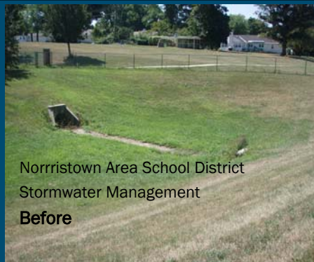
Norristown Area School District Stormwater Management