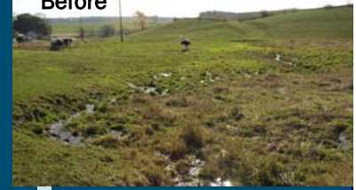
Seidel Farms Restoration